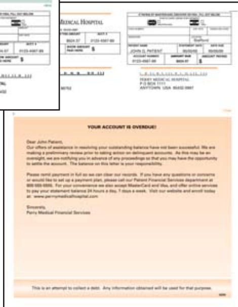
Past Due Notice