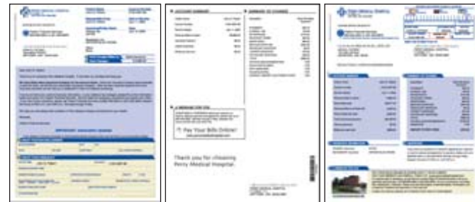
Acknowledgment & Insurance Status Letters