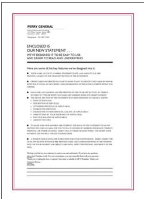
Key benefits - 8-1/2" x 11"