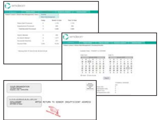
Emdeon utilizes the Postal Automated Redirection System to tackle today's returned mail challenges.